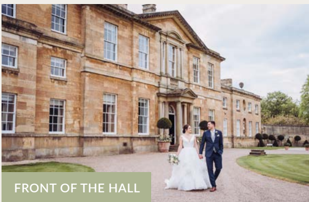
FRONT OF THE HALL