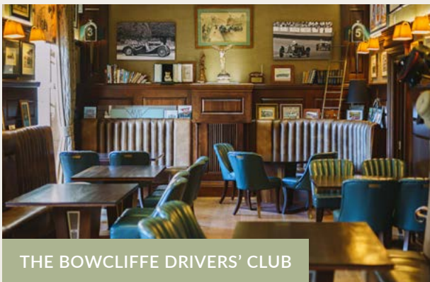
THE BOWCLIFFE DRIVERS' CLUB