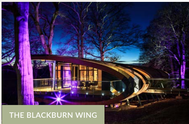
THE BLACKBURN WING