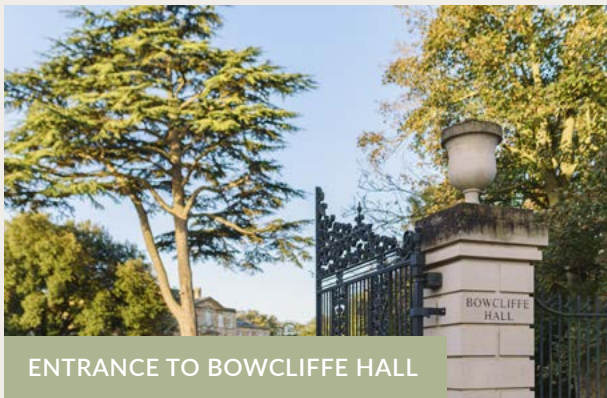
ENTRANCE TO BOWCLIFFE HALL